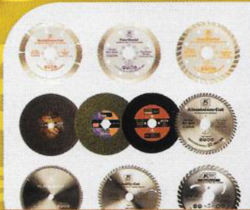
POWER TOOL ACCESSORIES